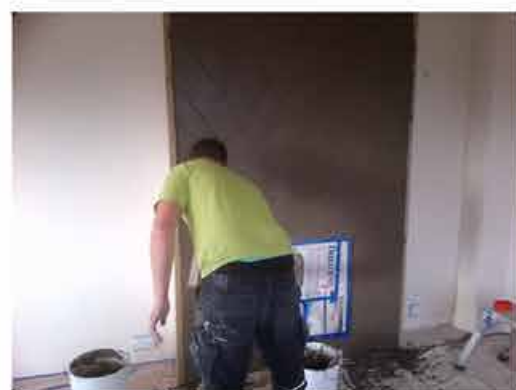
6. Trowel to a smooth finish and leave as a scratch coat.