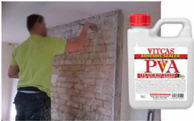
1. Coat the masonry with neat (undiluted) Vitcas PVA.

Before starting make sure that all traces of old gypsum plaster are removed from the wall. Tools and mixing buckets should be clean and free from old plaster or old Portland cement. Use only cold tap water for mixing.