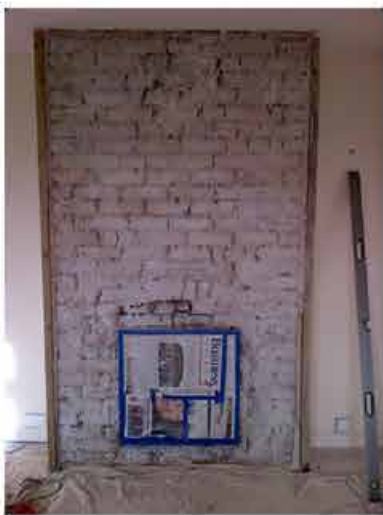
3. Attach pieces of wood at each side of the chimney breast at the depth to be rendered.