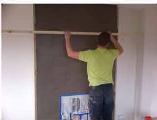
5. Use a straight edge between the two side guides to strike off the material.