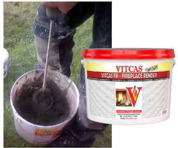
2. Mix Vitcas Fireplace Render with cold water.