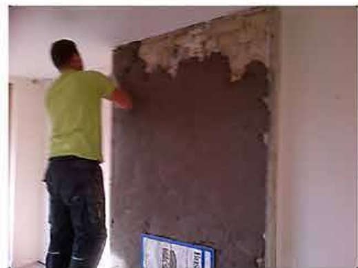
4. Apply the render to the chimney breast.